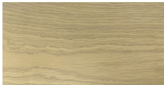
GEMTEC HARDWOOD CREATION