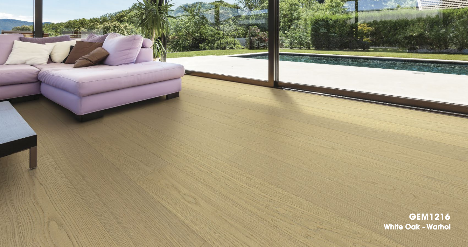
GEM1216 White Oak - Warhol