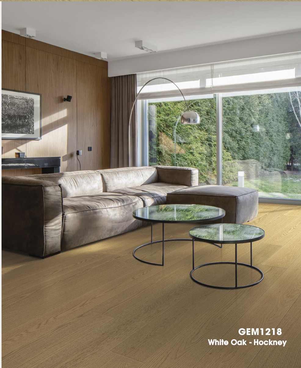
GEM1218 White Oak - Hockney

It fuses solid hardwood components to create a remarkably durable Creation. In addition to having 360° water protection, it is impact and scratch resistant, and won't delaminate. Creation hardwood performs under extreme conditions, including high traffic, and temperature extremes. It is electric and hydronic radiant-heat compatible too. Perhaps best of all, it's backed by one of the most comprehensive warranties in the business.